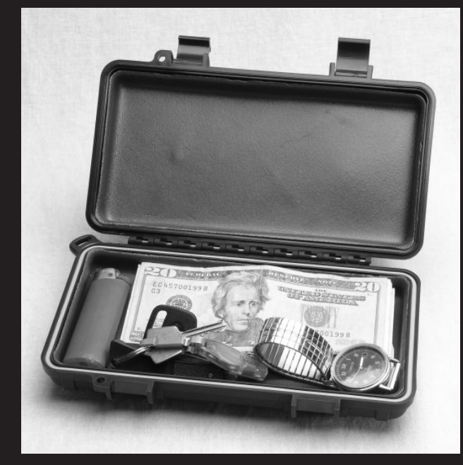
Secret Safes Magnetic Personal Property Protection