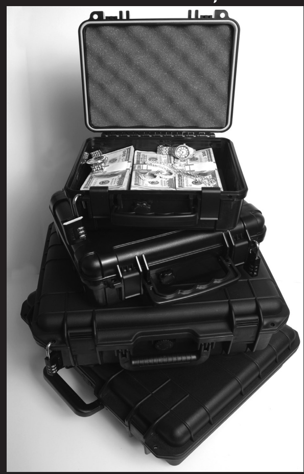
NEW! Extra large 7X-10X models All with Pick and Pluck Foam!