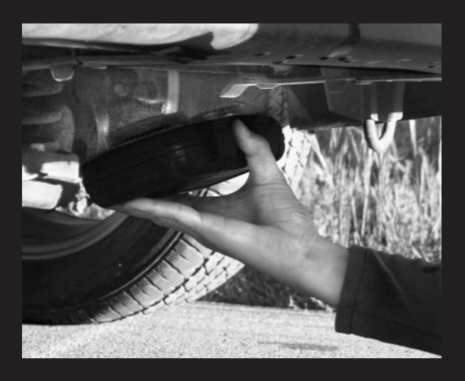
Available in Many Sizes Airtight & Waterproof Bad Ass Magnets