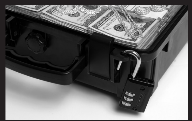
Lock Loops on 10 models